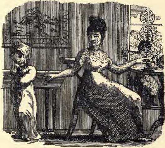
Drest or Undrest